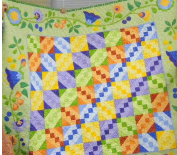
Quilt shown by Harriet Whitlock during show and tell.