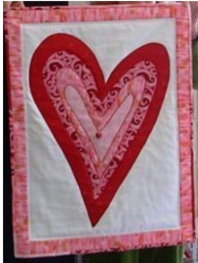
Quilt shown during Show and Tell in January 2010