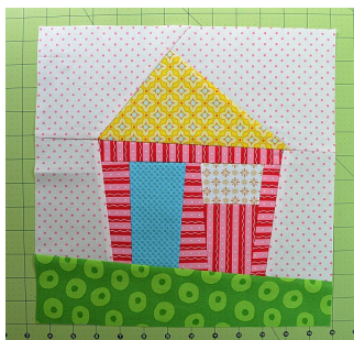
Wonky quilt and free tutorial on how to piece Wonky Houses can be found at: http://thesewingchick.com/

Tutorial on how to piece log cabin style wonky houses at: