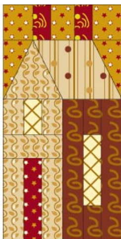
Tall House Block Free Pattern at:

www.mccallsquilting.com/patterns/details.html?idx=15108