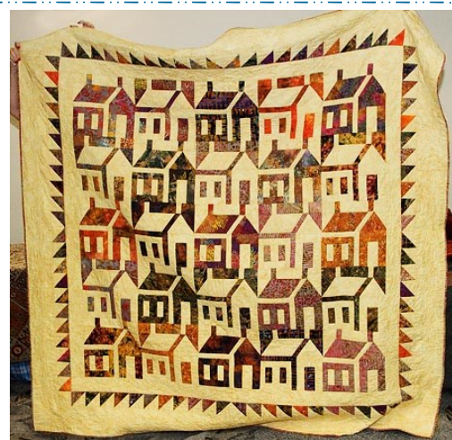
Cathy Izzo's "Schoolhouse" quilt seen at www.cityquilter.com/

www.mccallsquilting.com/patterns/details.html?idx=15108