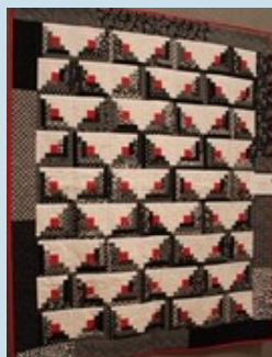
Quilt shown during Challenge