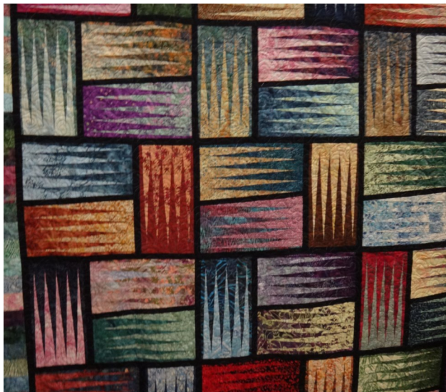
Quilt shown at the 2014 Charleston Quilt show.