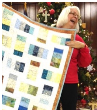
Some of our "Sew and Tell" this month

Merry Christmas and Happy New Year! See you next year!