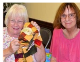
Friday class: The Lattice Quilt