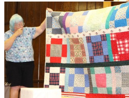
Sew and Tell