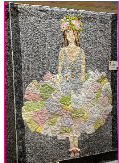
Best Art Quilt 2 nd Place Harriett Whitlock