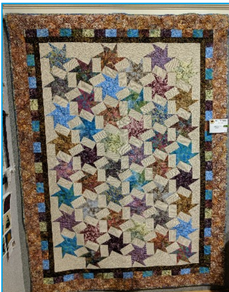
Best Machine Quilting 2 nd Place Beth Twedell