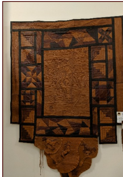
Best Art Quilt and Best Machine Quilting 1 st Place Lorene Arnette