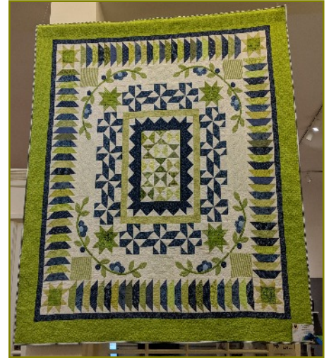
Best Use of Theme 2 nd Place Harriett Whitlock