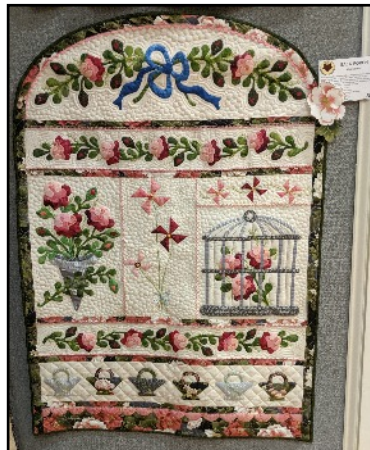
Best Applique 1 st Place Pam Turner