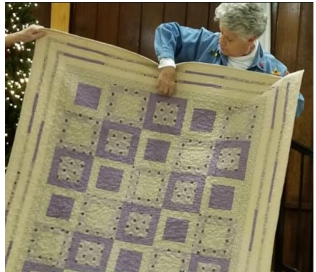
Gloria Griffin Square in a Square Quilt