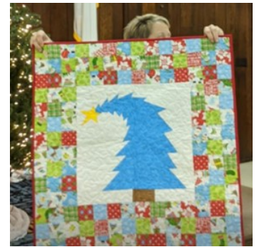
Brenda Gregg-Crooked Christmas Tree