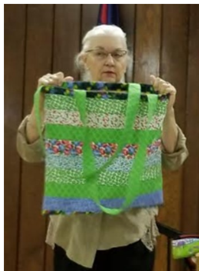
Lorene Arnette-Strip Quilt Bag