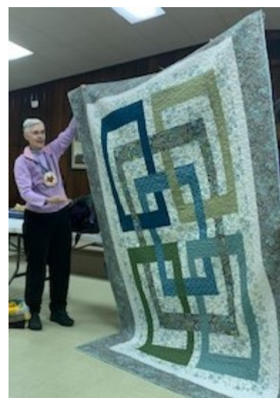
Ray Vance Interlocking