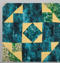
Cedars of Lebanon.