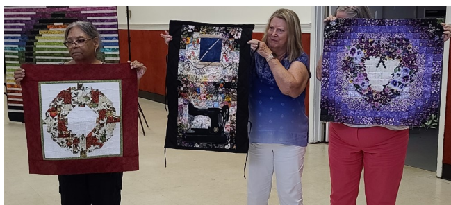
Some of the watercolor quilts from the class